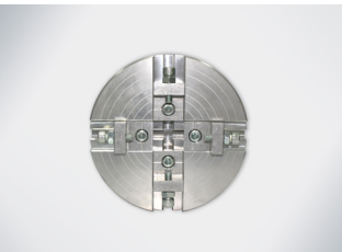
Welding neck support