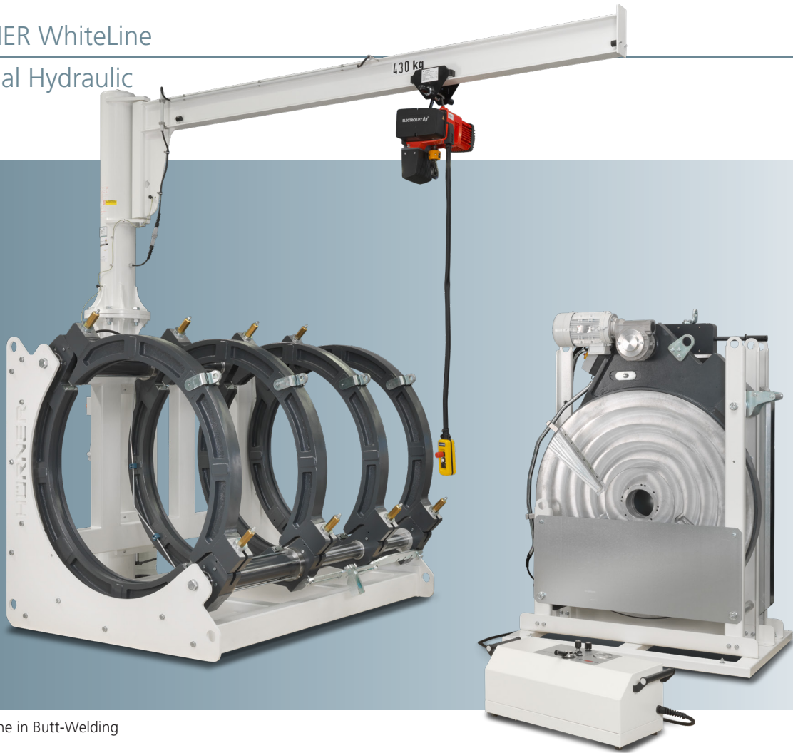
Stand-alone in Butt-Welding